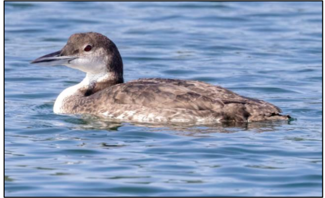
Common Loon | Benton Co.