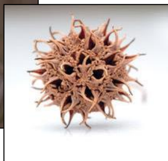
Milkweed pod and sweetgum ball | Quin Warsaw