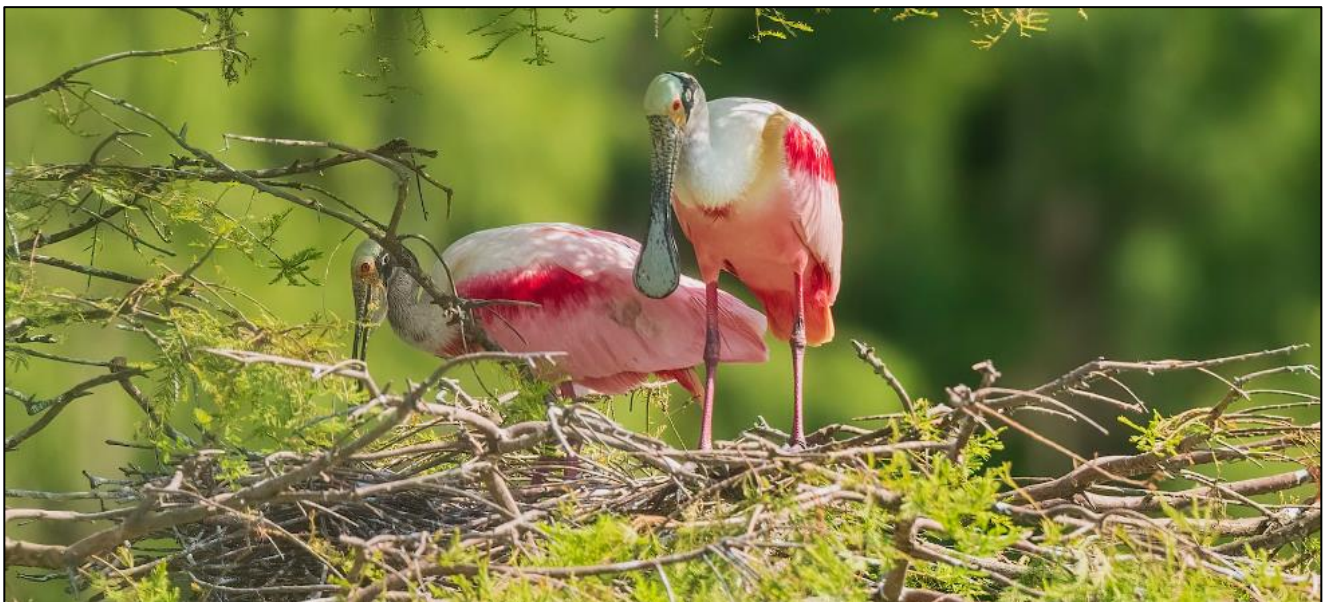
Nesting Roseate Spoonbills (2 nd nesting record for AR) | Miller Co.

Arkansas Audubon Society, P. O. Box 241421, Little Rock, AR 72223