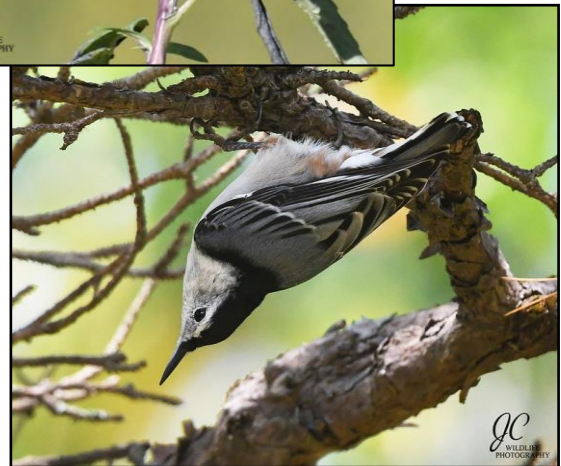
American Goldfinch and White-breasted Nuthatch

We are always searching for photographs that help validate the Bird-friendly Arkansas concept. Send your observations and photos to bfaudubon@gmail.com